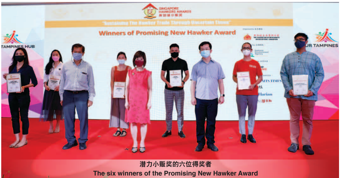
潜力小贩奖的六位得奖者 The six winners of the Promising New Hawker Award

O'Brain Express (Hawker Centre @ Our Tampines Hub)