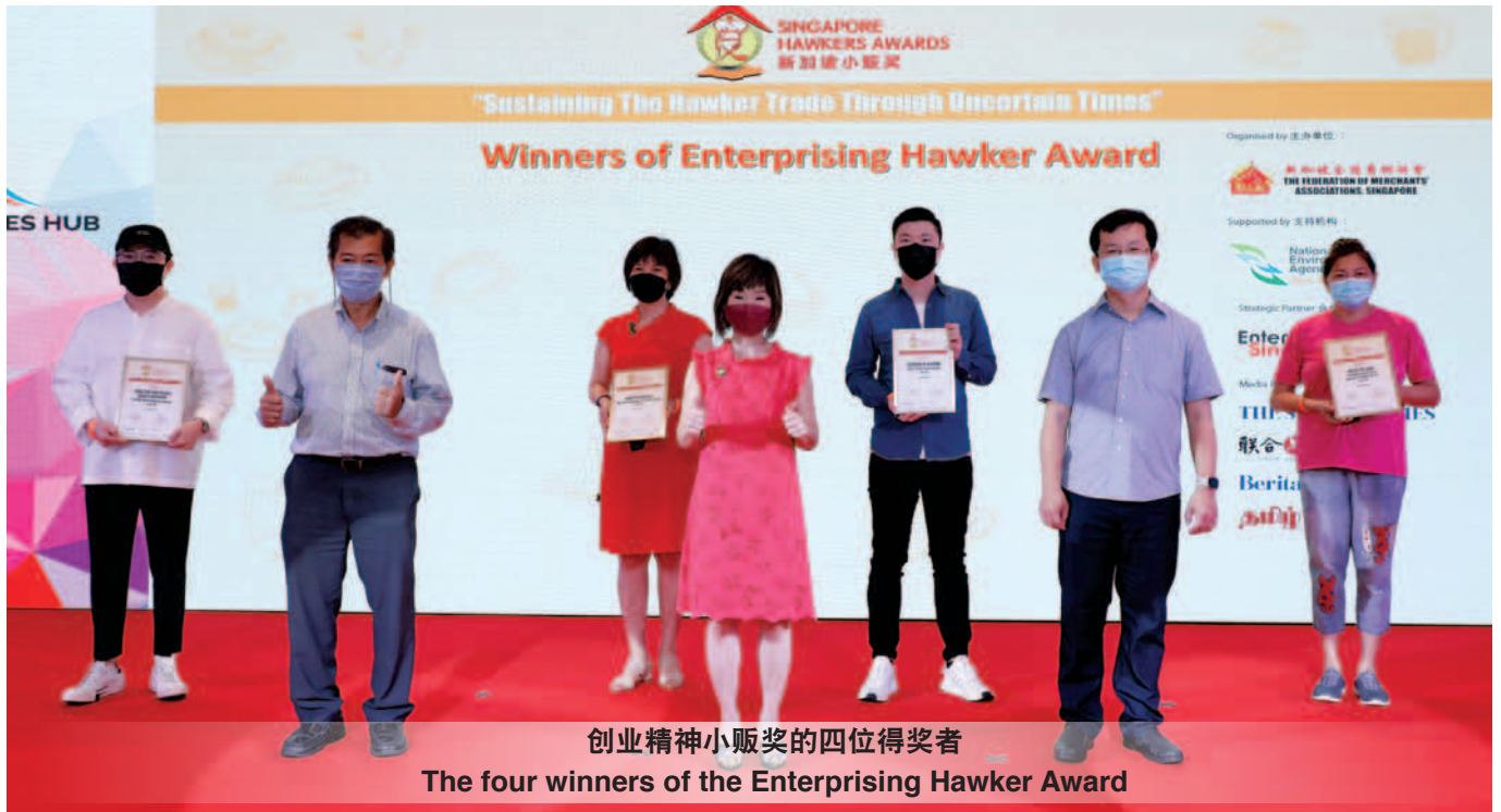
创业精神小贩奖的四位得奖者 The four winners of the Enterprising Hawker Award

Lagoon In A Bowl (Amoy Street Food Centre)